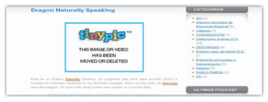
Figure 5. Podcast by a student at the Faculty of Education in Melilla

<http://kikote73.podcast.es/podcast.php?editor=kikote73>