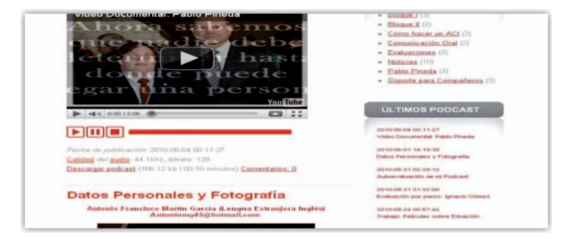
Figure 6. Podcast by a student at the Faculty of Education in Melilla

<http://amg85ugr.podcast.es/podcast.php?editor=amg85ugr>