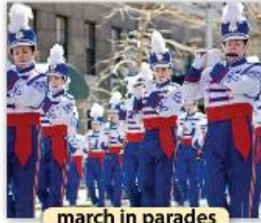
march in parades