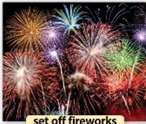
set off fireworks

A ▶ 4:06 Read and listen. Then listen again and repeat.