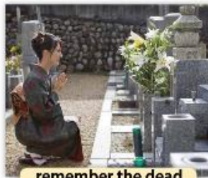
remember the dead