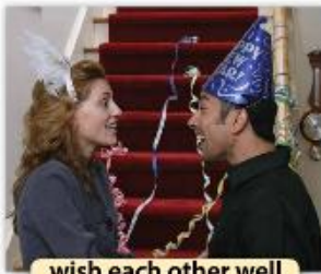
wish each other well