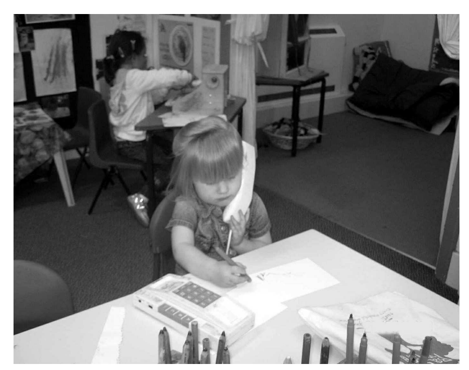
Figure 2.3 Playful activities for a young bilingual (24 months): writing down a phone message

Successive bilingualism is usually defined as occurring after the age of 3 and has, therefore, tended to be developed by children when they attend nurseries and primary schools. It is also stimulated by being old enough to play outside the home and of course it occurs among children whose families move between countries and linguistic communities. One positive advantage of successive bilingualism is the fact that the child has already learnt one language and has some general skill in handling people, the environment and linguistic concepts. Young successive bilinguals are also readily engaged in play activities (Figure 2.3) and playful language that supports second language learning linked with meaningful activities and key persons (Ruby et al. 2007). When bilinguals are acquiring other languages they may use a strategy of 'bridge-building' to get from a known language to a new language. This often involves using words from the new language, but they are organized by the grammatical patterns of the securely known language. This is a highly skilled temporary solution called 'inter-language' (Selinker, 1992). Very young bilinguals are also less likely to be self-conscious or upset about trying other language forms and pronunciations. Thus, they quickly get to sound like native speakers.