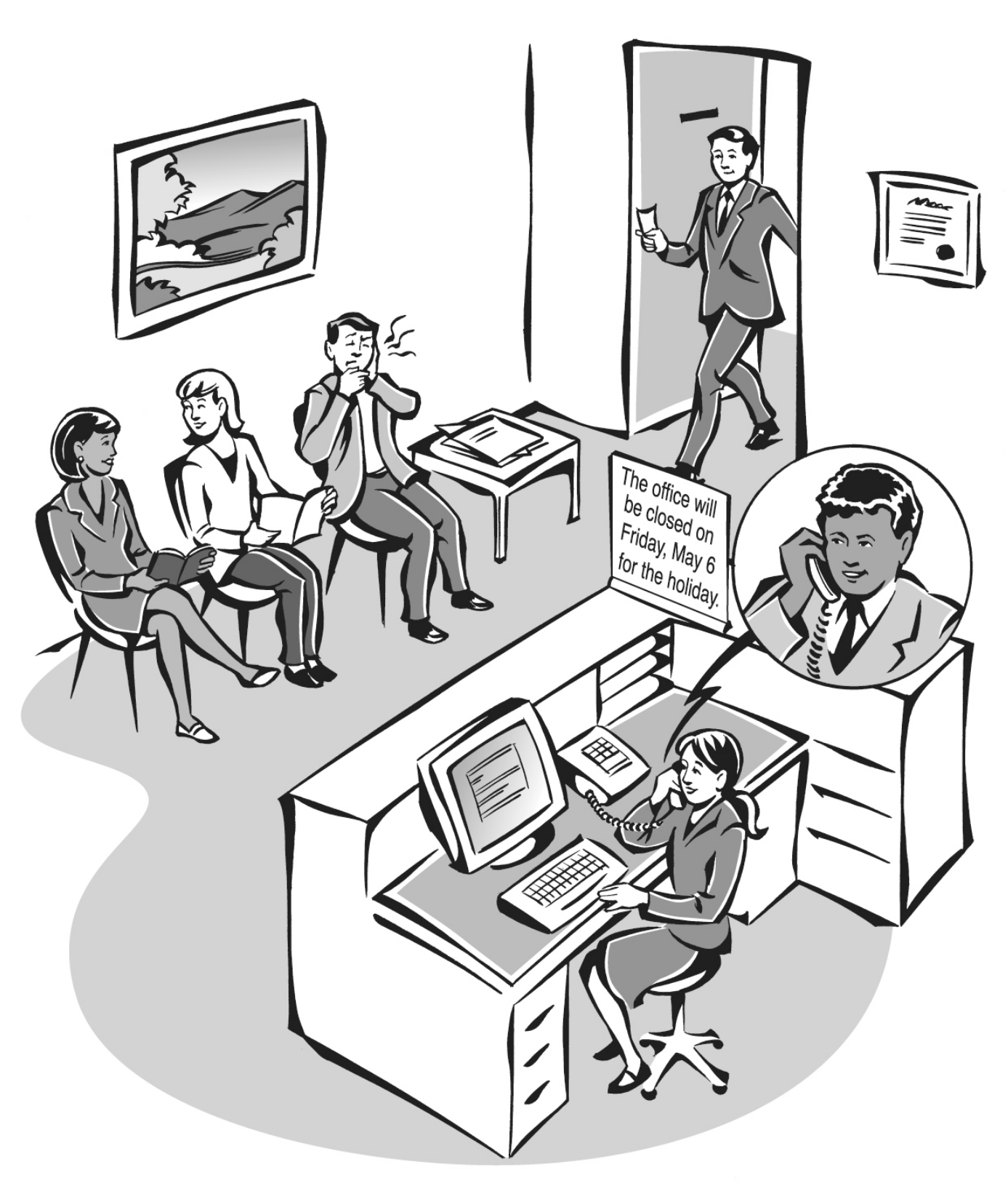
Level 3 —Units 1 - 5 Review Test Copyright © 2015 Pearson Education, Inc. All rights reserved. Permission granted to reproduce for classroom use.